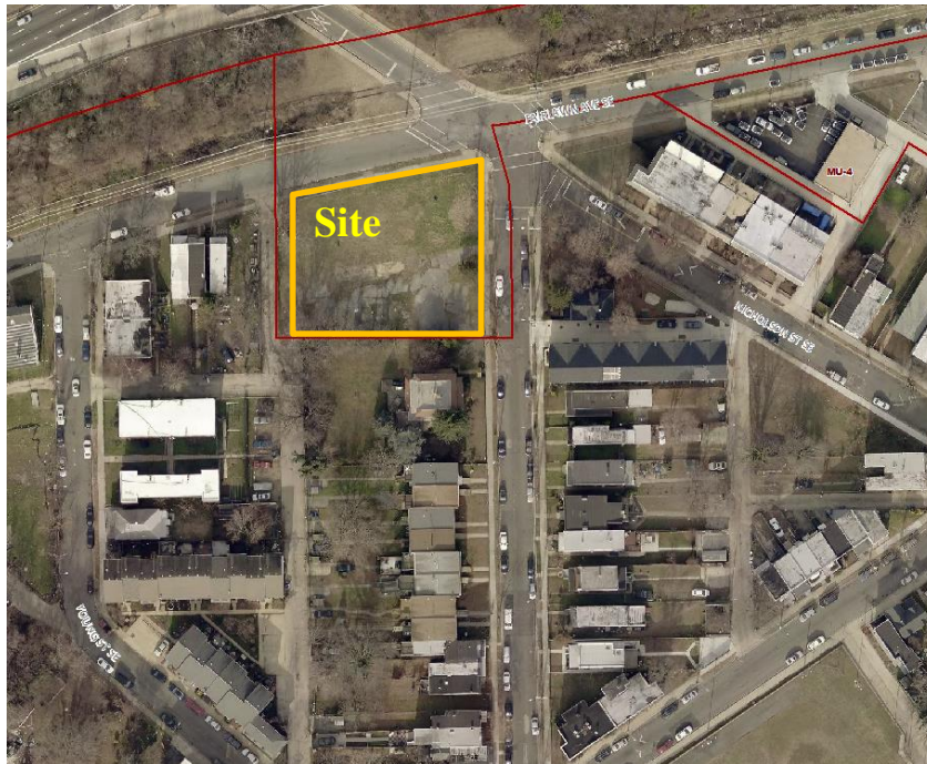
Figure 1 - Site

The site is bordered by Fairlawn Avenue, SE, on the north 22 nd Street, SE on the east, an alley on the west and residential properties on the south.